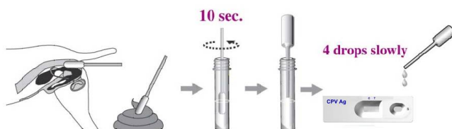
[Figure for test procedures]